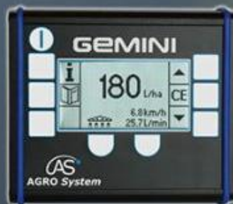
GEMINI control unit